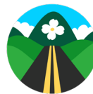
New to WNC Colleague Network